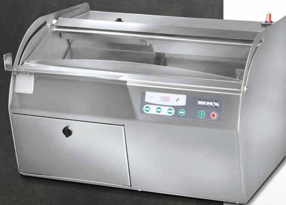
MHS IDEAL SB LIGHT