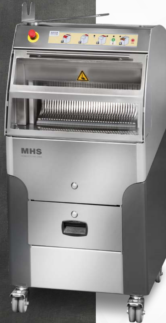
MHS BASIC SB