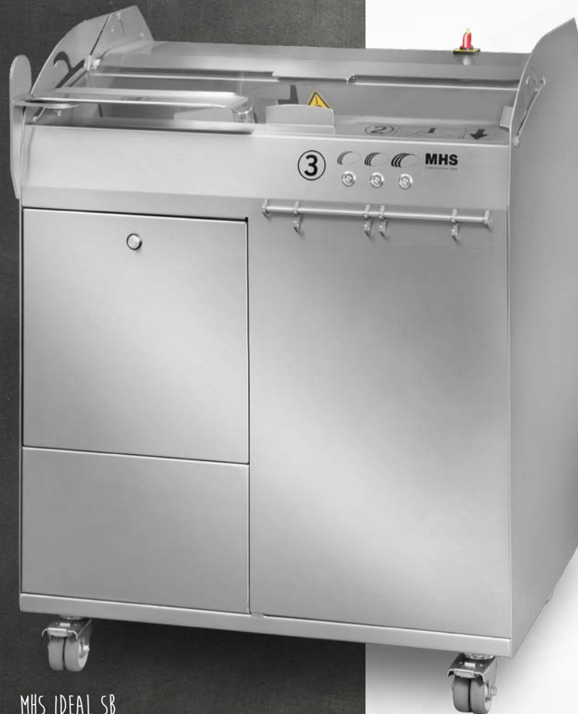
MHS IDEAL SB