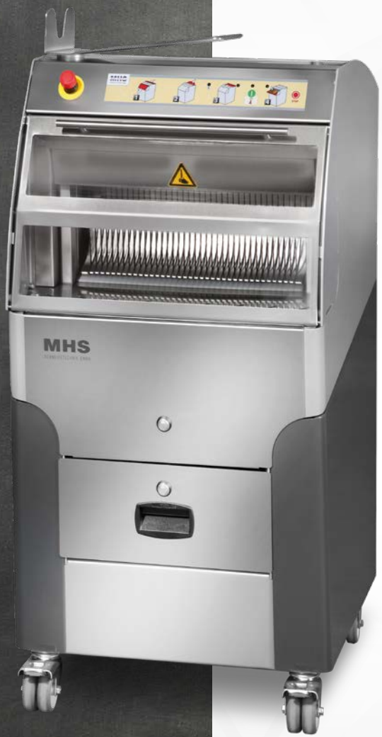
MHS BASIC SB